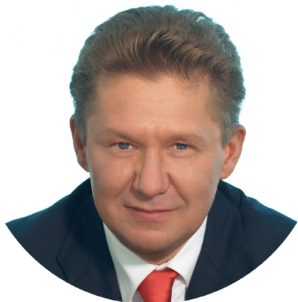
Alexey Miller Deputy Chairman of the Board of Directors, PJSC Gazprom